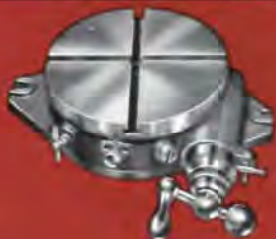
Table is graduated 0° to 90° in each quadrant by degrees and crank handle dial in 240 minutes by minutes, with a 90-1 worm and wheel ratio. The table has two 5/8" size T-slots at right angles to each other for 3/8" T-bolts. Overall height of table is approximately 2 3/4".

An accurate, precision ground, heavily ribbed 7" diameter rotary table complete with keys in base, conveniently located crank handle, lock and eccentric throw-out device for worm. Provision is made for takeup for wear.