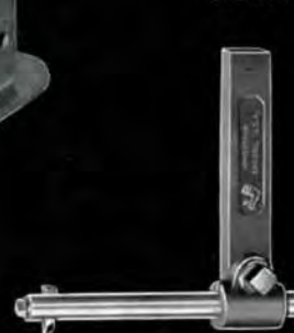
No. 47 Extension Shaper Tool